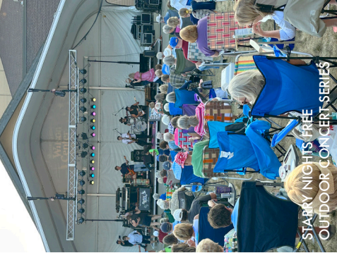
STARBUCKS NIGHTS: FREE OUTDOOR CONCERT SERIES