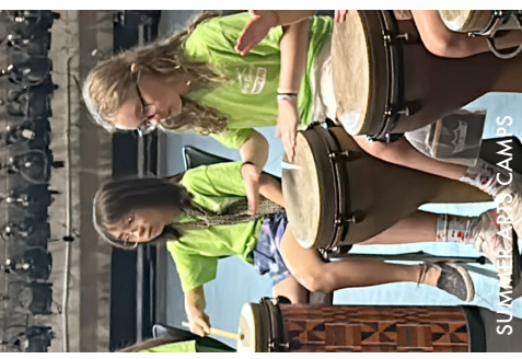
SUMMER PERFORMING ARTS CAMPS