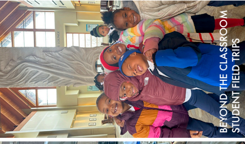
BEYOND THE CLASSROOM STUDENT FIELD TRIPS