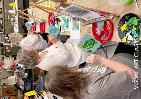
VISUAL ART CLASSES