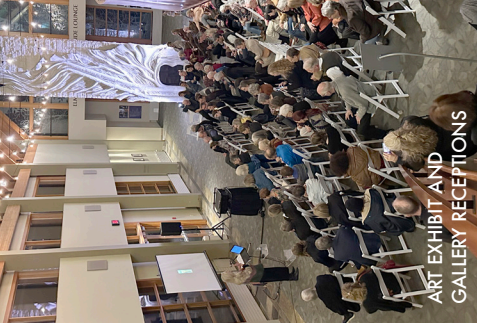
ART EXHIBIT AND GALLERY RECEPTIONS

The Sharon Lynne Wilson Center for the Arts is a multidisciplinary, nonprofit, cultural arts facility situated in Mitchell Park in Brookfield, Wisconsin. We provide access to the arts through: Performing Arts, Arts Education, and Visual Arts. We are proud to offer the community many ways to experience the arts: